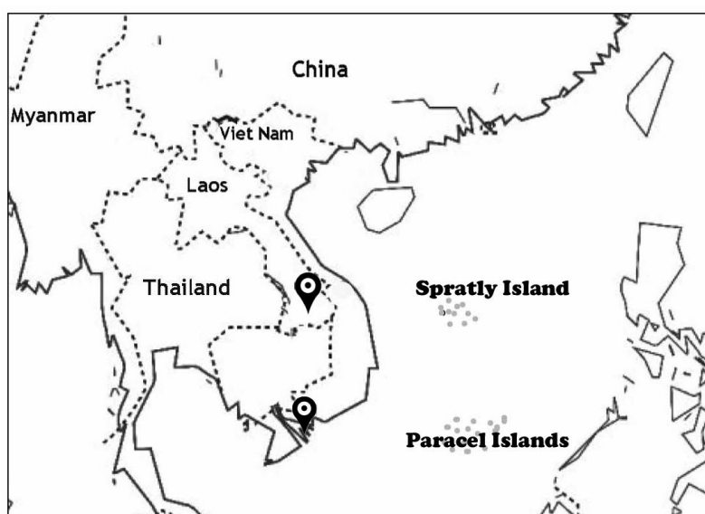
Fig 2. Distribution map of Kaempferia champasakensis Picheans. & Koonterm. showing its localities in the world

This study has been recorded the occurrence of Kaempferia champasakensis Picheans. & Koonterm. to flora of Vietnam for the first time. Kaempferia champasakensis Picheans. & Koonterm. is characterized by its pure white flowers with the labellum divided two-third to the base and the large white ovate-elliptic to suborbicular anther crest with greatly varied apex. Present report will help prioritizing conservation of this species in Vietnam.