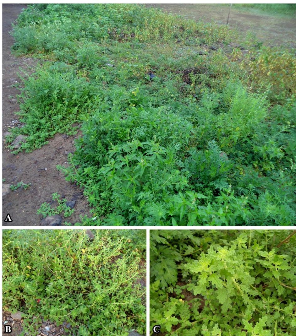
Fig. 1. Dysphania pumilio (R. Br.) Mosyakin & Clemants; A. Habitat; B. Habit; C. Close view of habit.